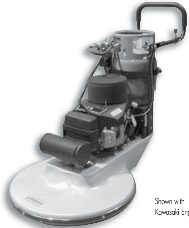
Shown with Kawasaki Engine

NU21PBH-11 - NU21PBH-13 NU21PBK - NU24PBK NU27PBK